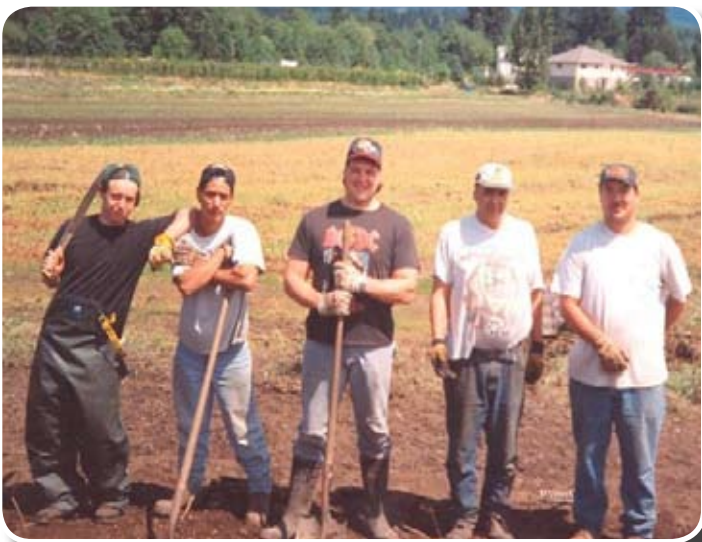
Contruction of the playground at the old band hall Year _____