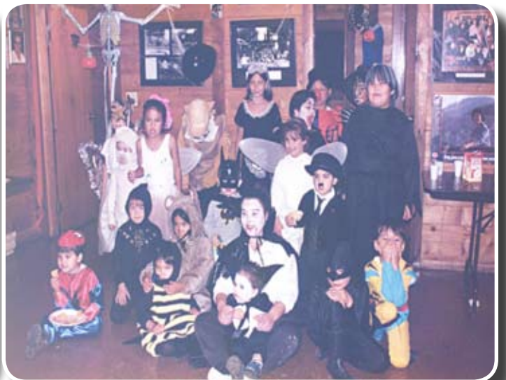
Hupacasath Halloween Party Year _____