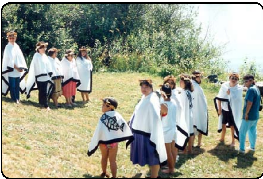
CAN YOU NAME ALL THE INDIVIDUALS IN THIS PHOTO?